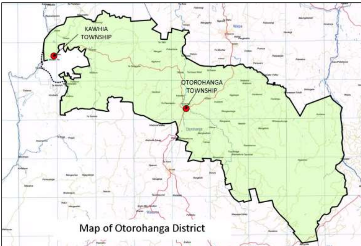
Figure Two: Ōtorohanga District

and licensee unless a full licence application has already been filed, or, in exceptional circumstances, with the prior approval of the Chairperson of the Licensing Committee.