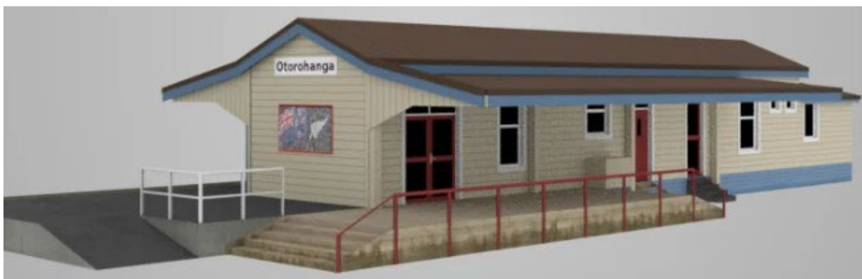
Above, Street frontage Wahanui Crescent, Ōtorohanga Railway Station building