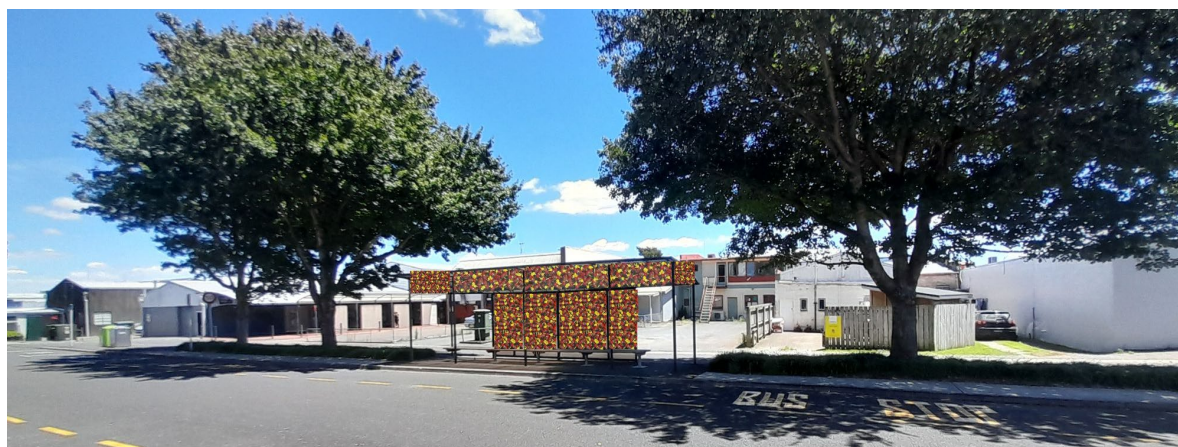
Above, Image for illustrative purposes only