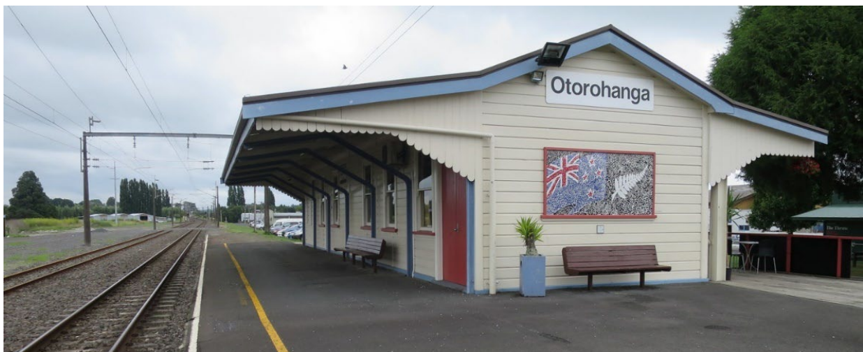
Above, Platform side of Ōtorohanga Railway Station building

The Board may wish to indicate a preference for signage location, noting that signage cannot impede upon the train platform.