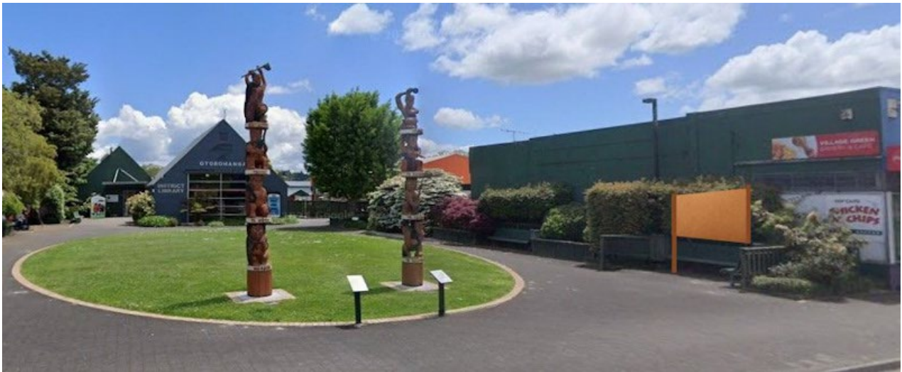
Above, The Village Green, Maniapoto Street, Ōtorohanga. Image is to illustrate location and not indicative of noticeboard design.

Board input is invited on design considerations and the Village Green location.