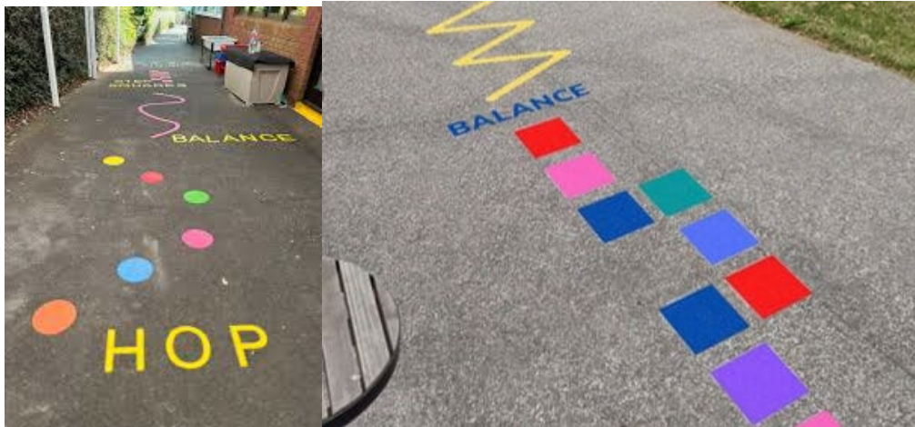
Above, Images are for illustrative purposes only.

Board input on street locations and types of games are welcomed.