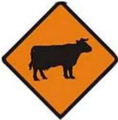
TW 6A HINGED