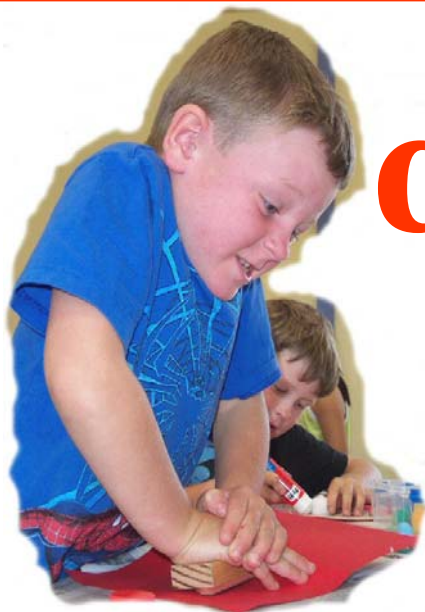
The creative spirit at work during our Christmas Crafts session!